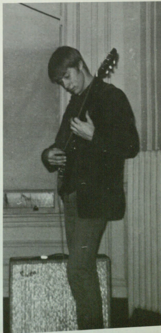
An F sharp minor diminished ??