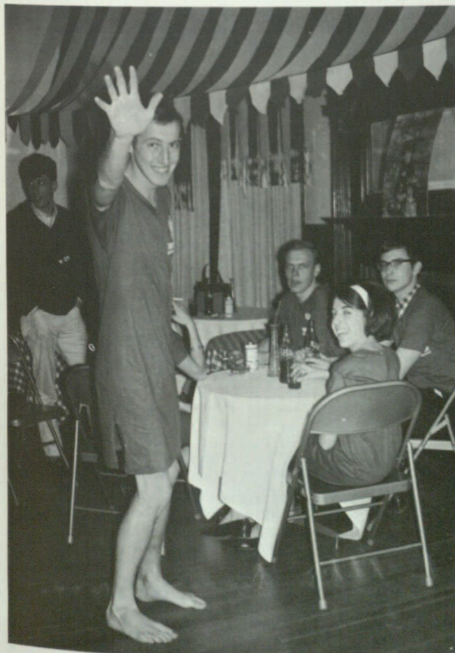
Stay away from me with that vacuum cleaner