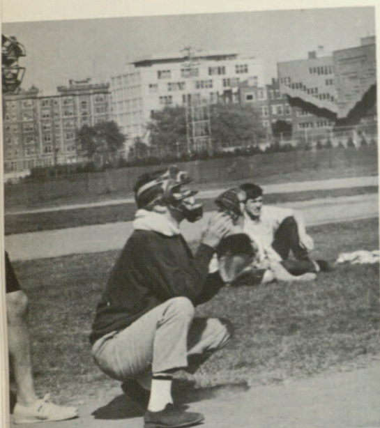
I hope he can hit