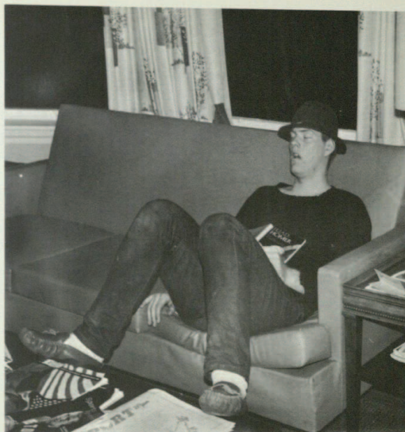
"Humanities play an important part in an M.I.T. education"

At Theta Delta Chi we stay on the move and make the most of our college years.