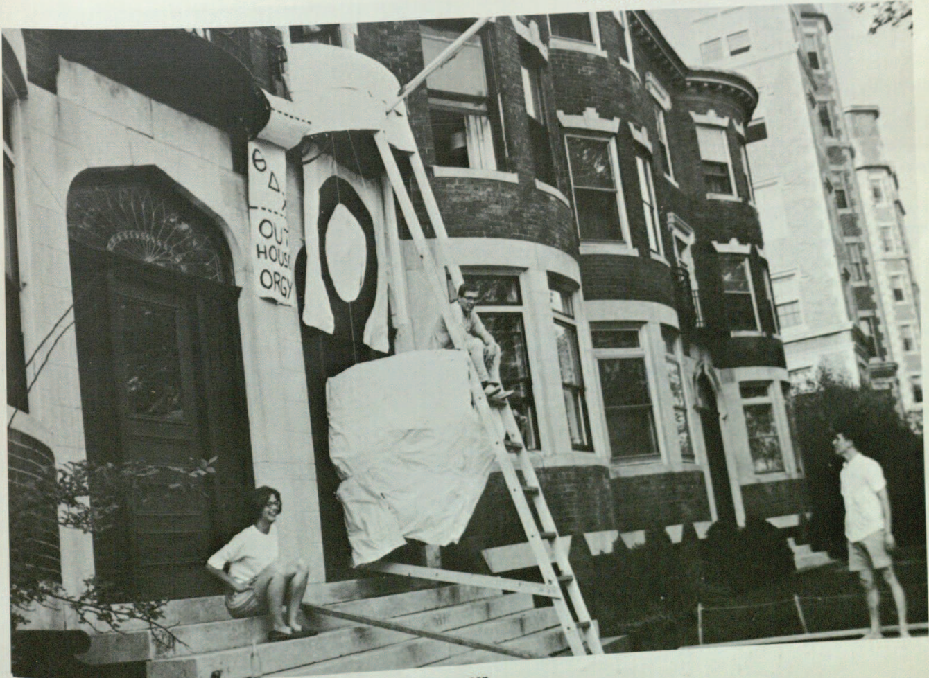
A disease like that would drive a normal man indoors