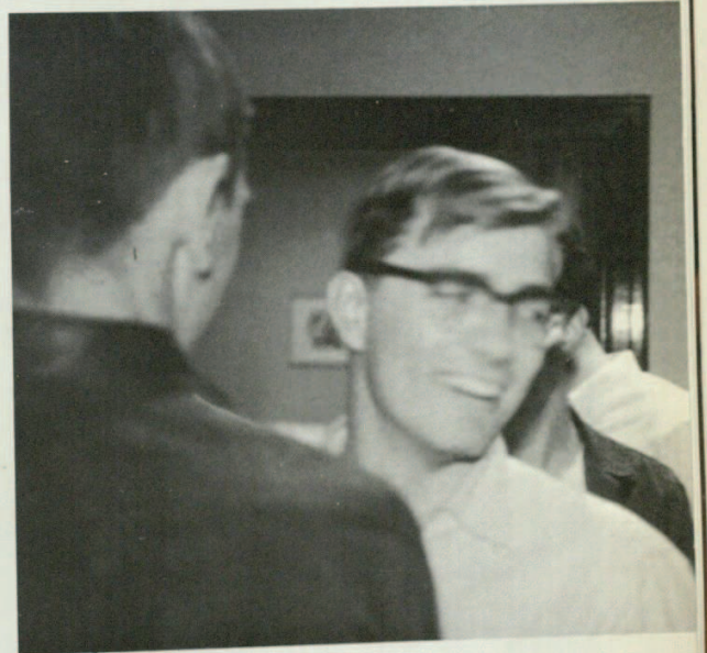
Very funny, pledge; say that again