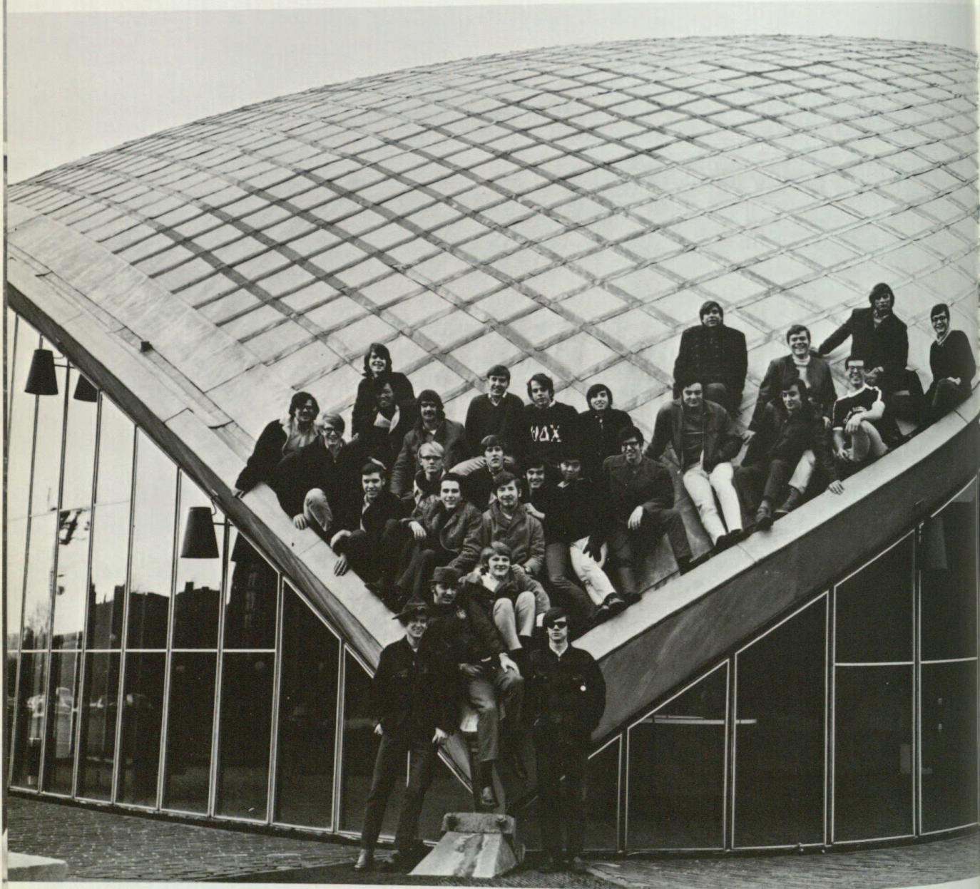
Theta Delta Chi