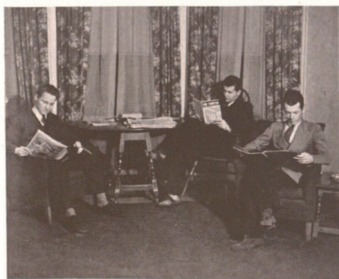
"Room with a View"

In 1903 a number of Tech students organized a local fraternity, Alpha Epsilon. The society petitioned for admission into the