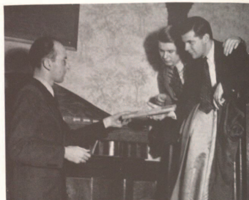
"Have You Forgotten so Soon"

Theta Deuteron endeavors to maintain a balance among extra-curricular activities, social functions, and scholastic work. Every man may be credited with some activity, although the personal selection varies widely. Athletics draw both players and managers; undergraduate publications entertain some; others are attracted to the more purely social institutions, such as the Glee Club or professional societies. Three formal dances are held at the chapter house during the year, and they are supplemented by frequent in-